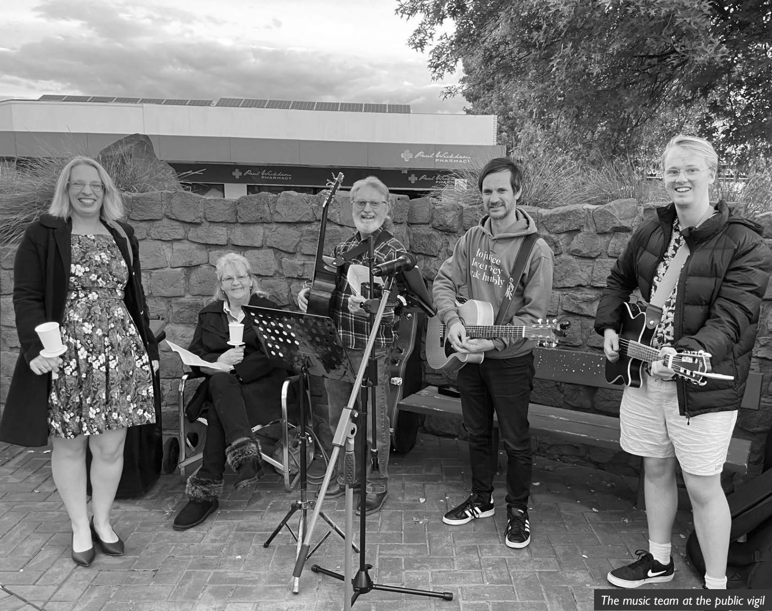
The music team at the public vigil