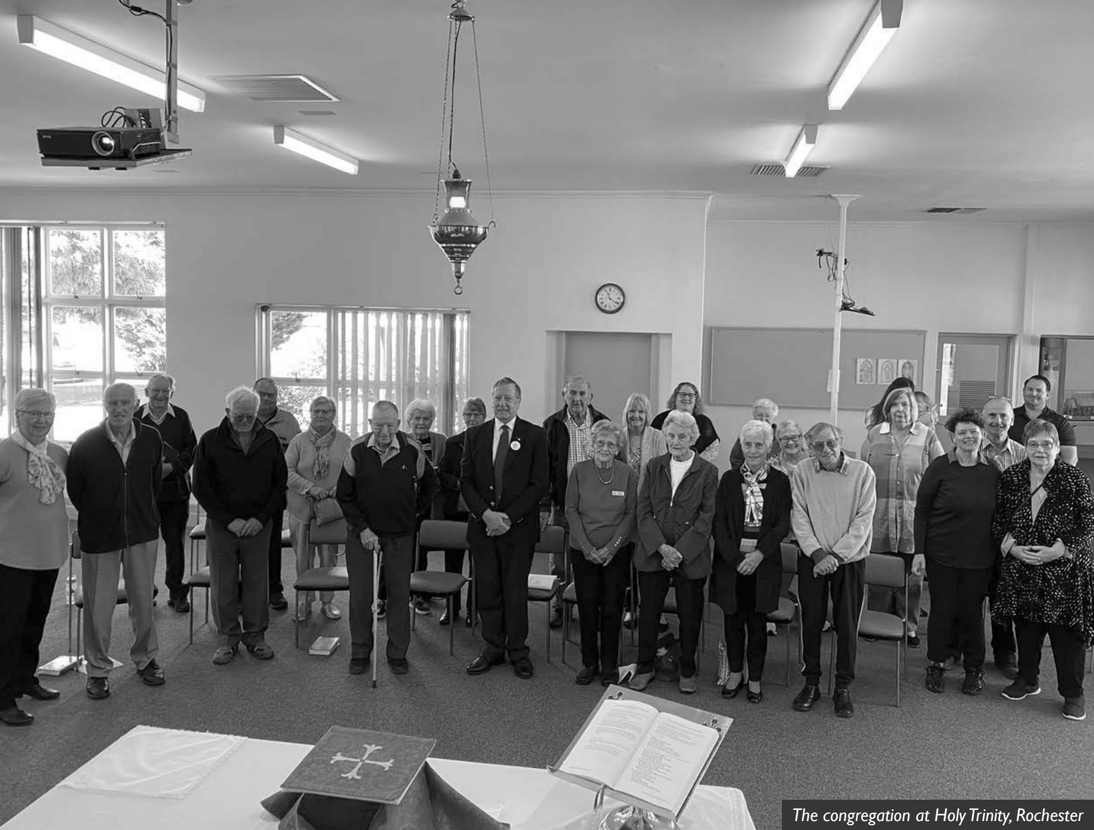
The congregation at Holy Trinity, Rochester