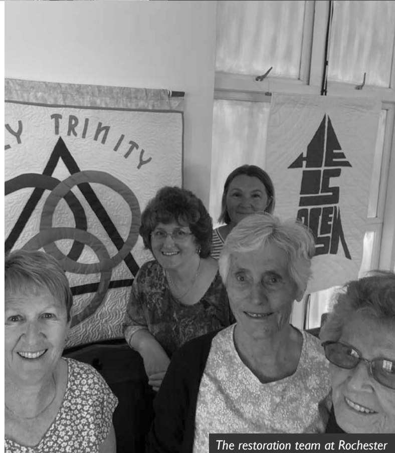
The restoration team at Rochester

The people of Rochester have been grateful for the support of many organisations from other towns. We do not know if Rochester will experience such trauma again but we pray that this will not happen.